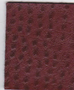
732801 TPH-011 RUBY