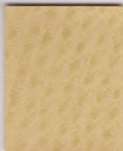
732798 TPH-008 LEMONADE