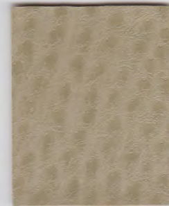
732803 TPH-013 WILLOW