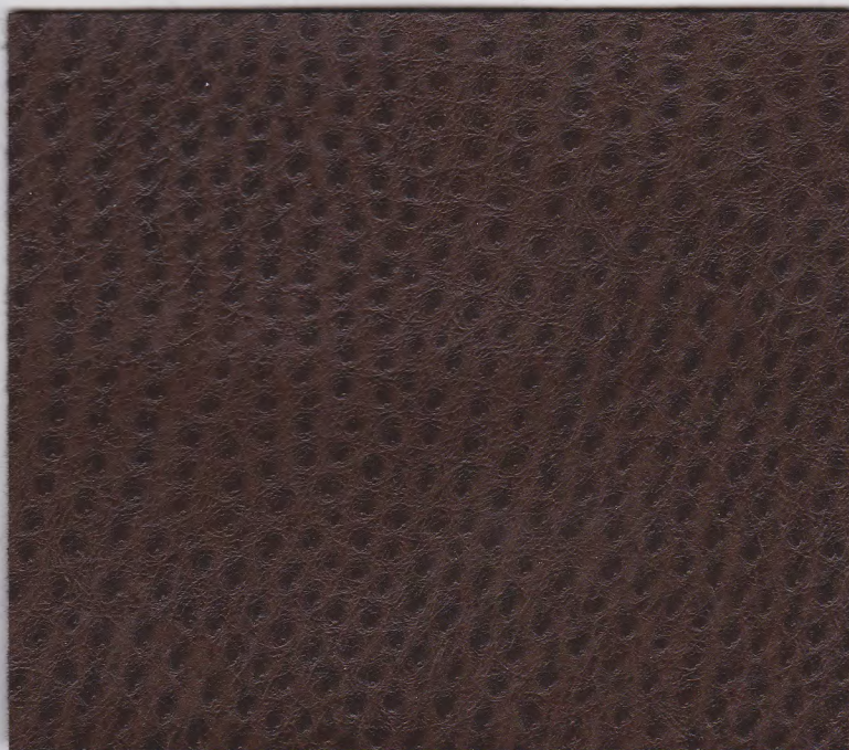
732794 TPH-004 CHOCOLATE

California Technical Bulletin 117, SEC. E