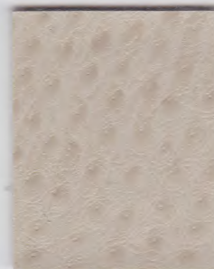
732797 TPH-007 FOG