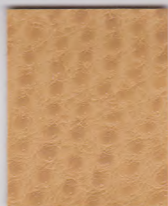
732791 TPH-001 BISCOTTI