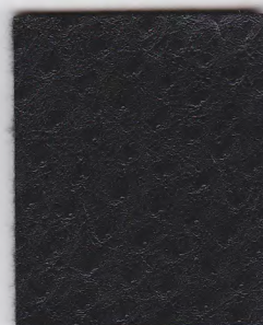
732793 TPH-003 CAVIAR