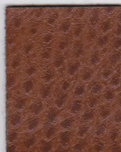
732800 TPH-010 OUTBACK