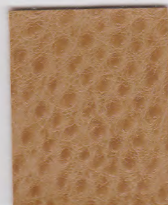
732799 TPH-009 OCHRE