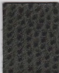
732792 TPH-002 BLACK FOREST