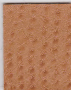
732795 TPH-005 CHUTNEY