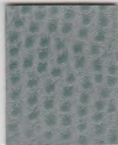
732796 TPH-006 DRIZZLE